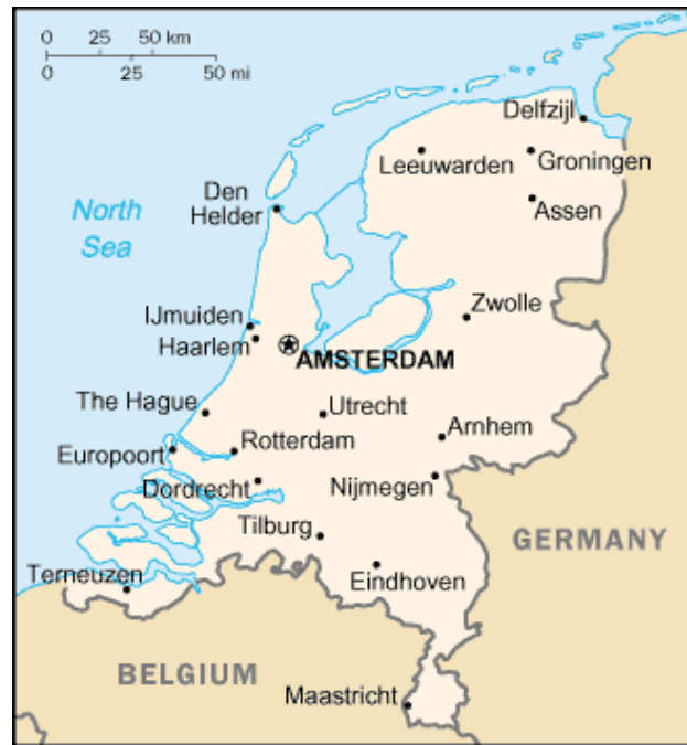
Figure 1. Location map of The Netherlands ( http://www.phpclasses.org , 2005)

The Netherlands forms part of Western Europe, bordering the North Sea, between Belgium and Germany (Figure 1).