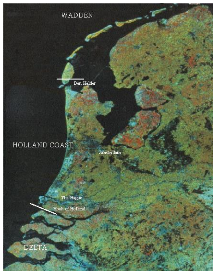
Figure 2: The three sections of the Dutch coast ( Heij and Roode, 2003 Eurosion Report ).

The geology of The Netherlands coastline offers a natural sandy defence to the sea yet is highly vulnerable to marine and fluvial flooding. The greater part of the country is low-